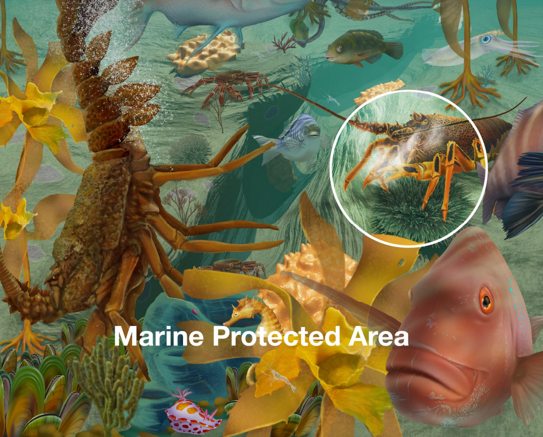
Marine Protected Area

Ecosystems have evolved over millennia and have delicate predator-prey relationships. Removing predators, in this case tamare (snapper) and koura (rock lobster) allows kina (urchins) to overgraze kelp forests.