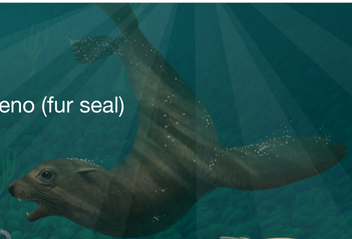
Kekeno (fur seal)

They are one of the most productive marine habitats found in New Zealand, and are an important food source for people and many marine species.