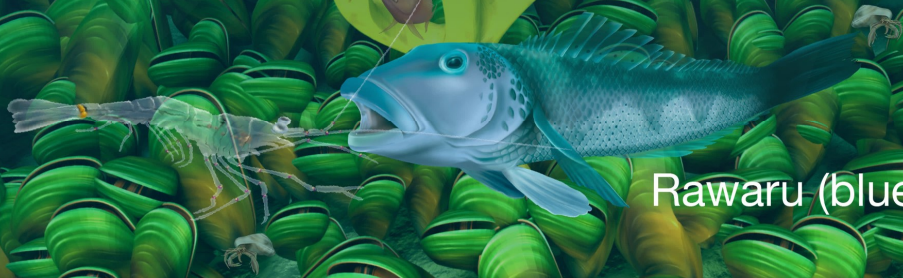
Rawaru (blue cod)